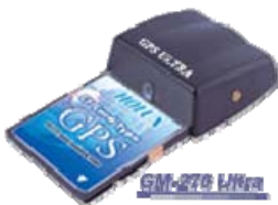
Figure 7. Holux CF Card GPS receiver.