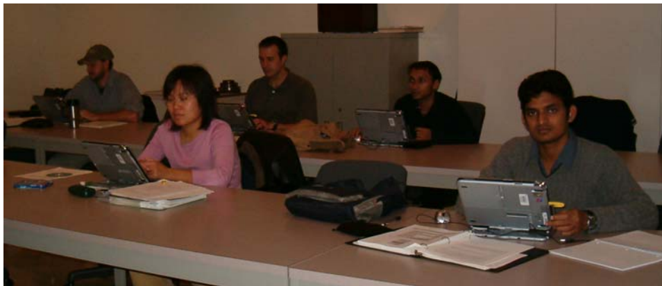
Figure 11. Students used the tablet PCs during in-class exercises, quizzes and open labs. ArcGIS USB keys allowed students to take full advantage of the ArcInfo level functionality of ArcGIS. For those students still reluctant to use the pen as their cursor device, a USB mouse was provided.

Students were provided tablet PCs to use at every class session (Fig. 11) for brainstorming sessions, exercises, and even quizzes. They were also encouraged to take advantage of the tablet PCs for collaboration and presentations of course