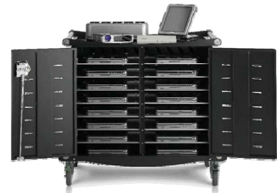
Figure 2. Tablet Storage Cart

A standard classroom was utilized and the student tablet PCs wheeled to the class via a mobile cart (Fig. 2). Each tablet PC was assigned a unique ID, allowing students to use the same computer for each course session. To prevent data loss, students were advised to acquire a USB flash drive.