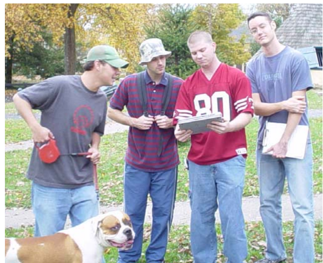
Figure 5. Students use the Tablet PC for GPS download of GPS data and conversion with Trimble's Pathfinder Office software.