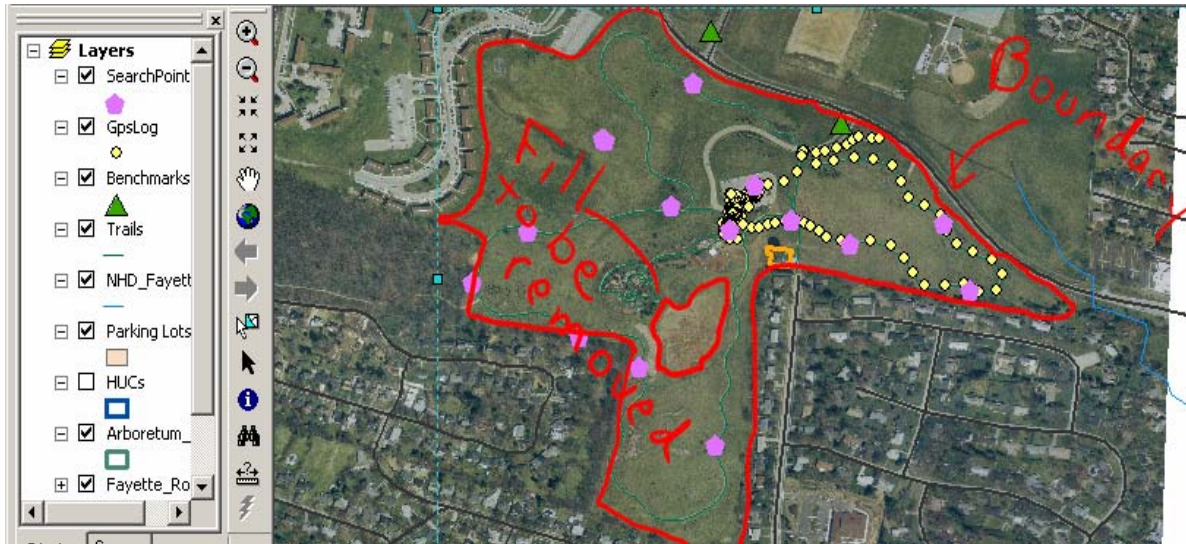
Figure 9. Screen shot of student Tablet PC showing collected GPS data points, inked boundary and additional notes made with ink capabilities of the Tablet PC within ArcGIS.

Utilizing the GPS toolbar (Fig. 10a), students were able to view real-time GPS data and see the points as they were collected (Fig. 9). Time did not permit students to accomplish all the tasks in the field, so the data collected in the field was taken back to the classroom for further exercises in data manipulation, editing and analysis, using both traditional Editor and Tablet Tools toolbars (Fig. 10b).