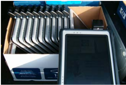
Figure 6. Tablet PCs with GPS receivers attached. With the keyboards detached, the tablet PCs are very portable.

BAE's "GIS Applications in Water Resources" class had the opportunity to use individual, integrated GPS/GIS for data collection in a module developed utilizing the tablet PCs (Fig. 6) equipped with Holux GM-270 Ultra CF Card GPS units (Figs. 6 & 7) connected through the PCI interface and a CF card adapter. This integrated system allowed students to collect GPS points, create and edit attribute data and overlay the newly collected information with existing datasets and rasters completely within ArcGIS while in the field (Fig. 8).