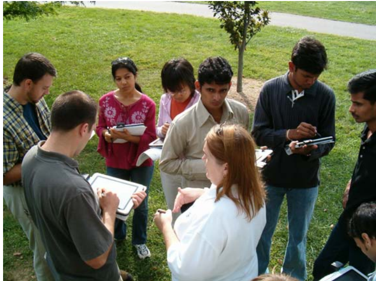
Figure 8. Students receive instructions and background for data collection exercise.

The University of Kentucky and the Lexington-Fayette Urban County Government jointly administer an Arboretum adjacent to the university. This park covers 100 acres and has approximately two miles of walking trails. It is undergoing expansion as the university and the Urban County Government upgrade this popular family-oriented facility.