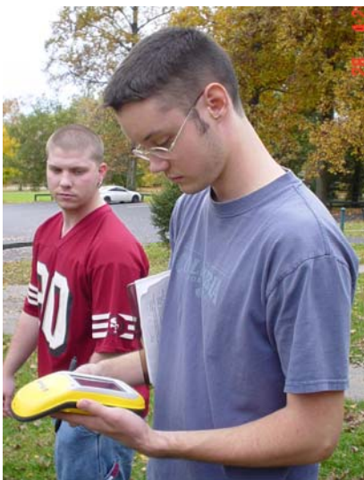
Figure 4. Students collect GPS data with Trimble unit.

Students had several opportunities to get into the “field” with mobile technology. One session in the “Spatial Data Analysis and Map Interpretation” (LCC) had students collecting GPS data in the field with a Trimble GPS unit and using the tablet PC for the Pathfinder Office software for validation and conversion in the field (Figs. 4 & 5).