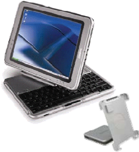
Figure 1. a) HP TC1100 with detachable keyboard and b) Docking station.

In May 2004, a team of instructors from BAE and a colleague from Lexington Community College (LCC) received an equipment grant from Hewlett Packard (HP) as part of its Mobile Technology for Teaching Initiative. This grant provided the department with the opportunity to augment and expand its training efforts using state-of-the-art mobile equipment. Twenty-one tablet PCs (Fig. 1a), eleven docking stations (Fig 1b.) and miscellaneous support equipment provided for each team member to have a tablet PC for course material development and presentation and a shared mobile classroom configuration of 15 tablet PCs for use by students in the classroom or in the field.