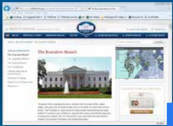
Internet / Browser