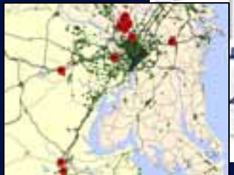
Greater WDC area