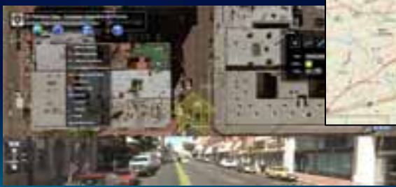
San Diego, CA