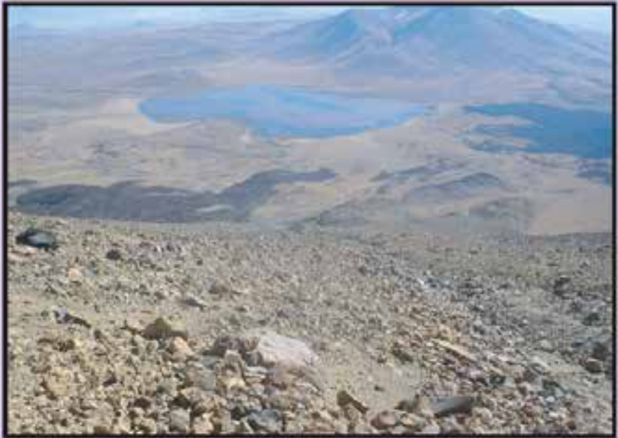
View over Malargue, Argentina