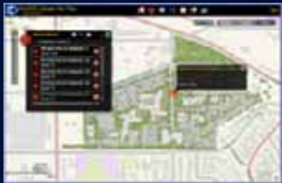
ArcGIS Viewer for Flex