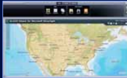
ArcGIS Viewer for Silverlight