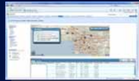
ArcGIS for SharePoint

http://resources.arcgis.com/content/web/web-apps