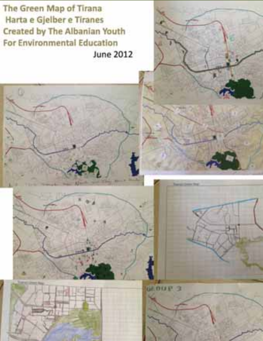
The Green Map of Tirana Harta e Gjelber e Tiranës Created by The Albanian Youth For Environmental Education June 2012