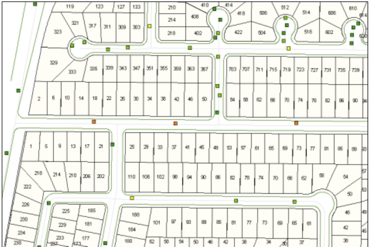
Figure 2: Seal Candidate.

Because of the homogeneity criteria used for the original segmentation of the City’s road networks, most segments will still be appropriate for full segment treatments. The spatial condition data, however, facilitates subsegment treatment selection. These treatments target smaller areas than the entire segment, thus ensuring that more segments are treated with available funding. Figure 3 below indicates how one crescent, which was effectively constructed as a single entity, demonstrates the impact of some different construction influences for part of the road. The entire south leg displays different characteristics from the remainder.