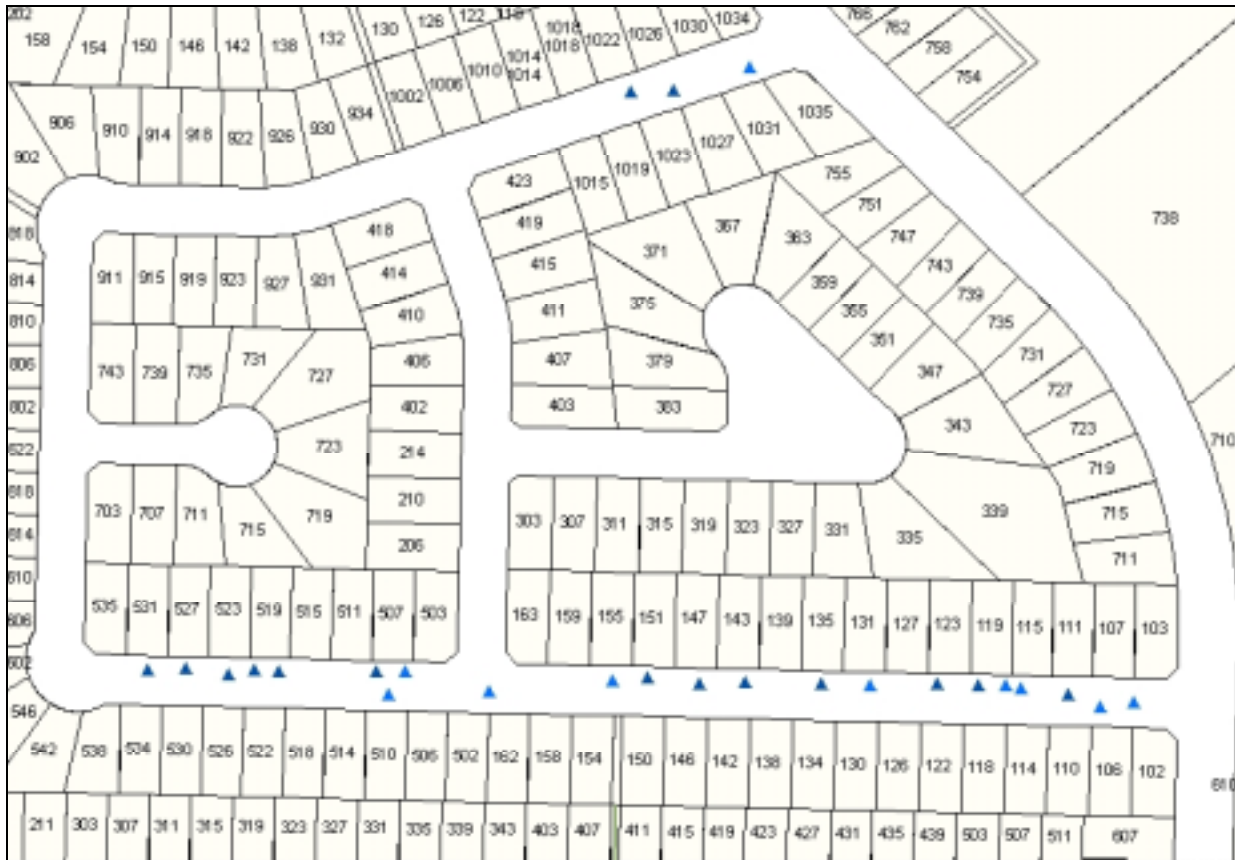
Figure 3: Subsegmentation Example.