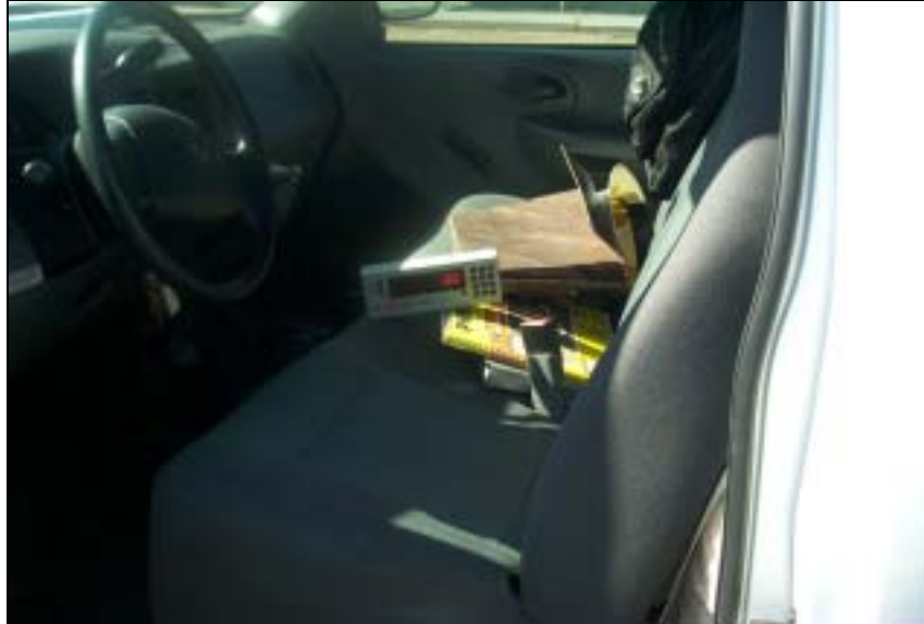
Figure 2: Pedometer for Measuring Street Width

been identified as an asset of the Department in the GIS Implementation Plan. The GIS team saw an opportunity to use GIS to help obtain more accurate street area measurements in a more efficient manner. Using GIS software and high resolution color aerial photography street pavement area could be captured and stored as polygons in the Department's GIS database.