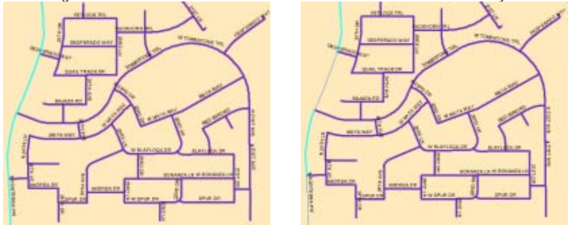
Figure 7: Street Centerline before and after the use of the Build Connectivity Tool

Build Polygon Tool: Most local Phoenix streets have a standard width of between 28.5 and 30 feet. On these standard local streets one side of the street is a mirror of the opposite side of the street. The build polygon tool allows the GIS technician to digitize the edge of pavement on one side of the street. The function then prompts the user to enter the street width. The edge of pavement line is copied parallel at the width supplied. The end points of the two parallel lines are connected with two new segments. The geometry of these four segments then is assembled into a single polygon. While the build polygon tool cannot be used on all streets, it reduces the time and effort to digitize pavement area for a standard street significantly.