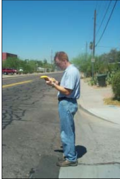
Figure 14: Field Verifying Pavement with ArcPad/GPS