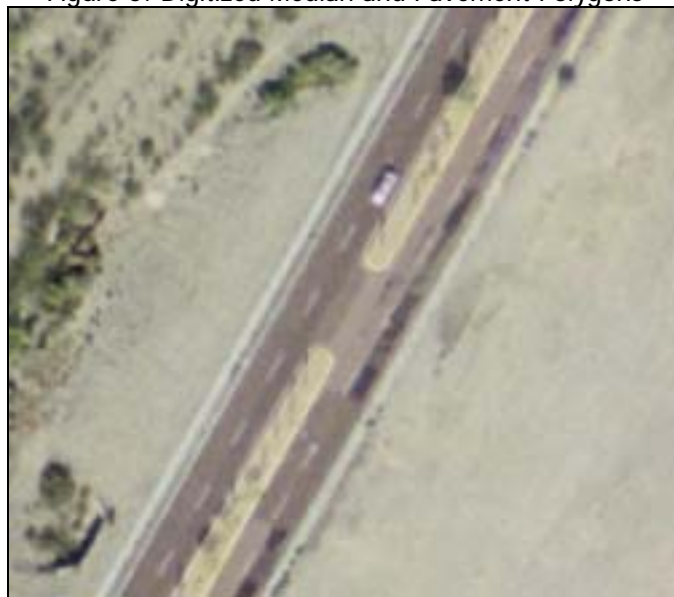
Figure 5: Digitized Median and Pavement Polygons

In the process of developing a prototype application the GIS team discovered that there were many issues with the geometry of the city street centerline layer. It appeared that while new developments had been captured quickly and accurately, street realignments and street abandonment in existing areas were not captured. The GIS team decided to cleanup the street centerline layer while pavement and medians were being captured. The city color orthophotos are used to assess centerline accuracy. If an existing street centerline falls outside a paved area than the centerline geometry is moved to the center of the pavement. If the aerial photos show that a street has been abandoned the centerline segment is deleted.