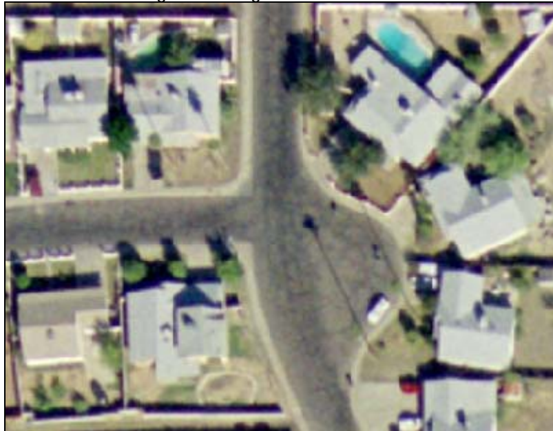
Figure 3: Irregular Pavement Area

In addition, to measurement accuracy, the GIS team took the opportunity to point out the time savings gained by using GIS for pavement measuring. The GIS team went out with field staff to make measurements for the proof of concept area. A breakdown of time required to collect and record the information is shown below: