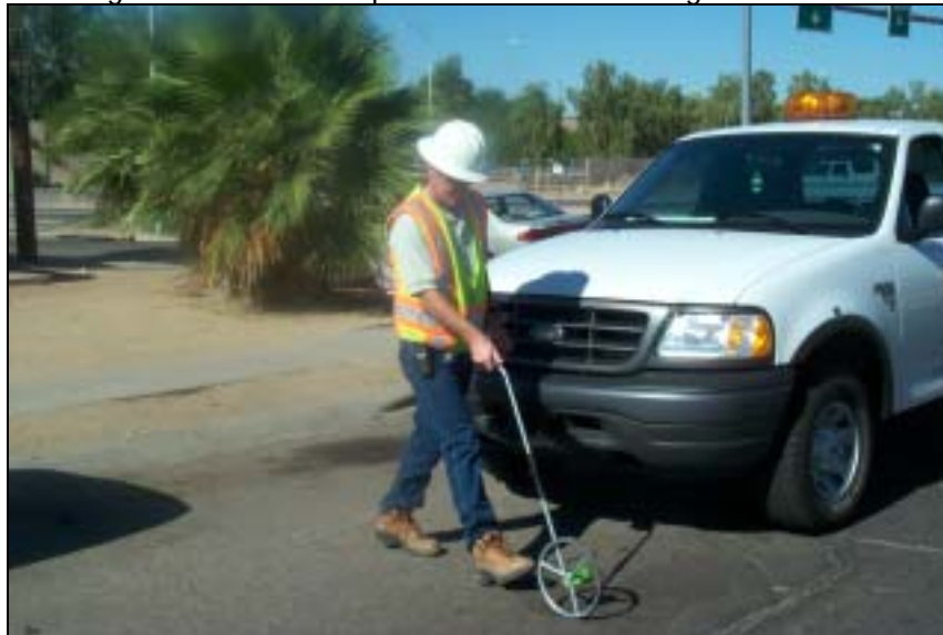
Figure 1: Street Transportation Staff Measuring Street Width

The Street Transportation Department began implementing a Department wide GIS based system for asset management in the fall of 2002. CyberTech Systems Inc. was contracted to help create a GIS Implementation Plan and provide onsite technical assistance. Pavement had