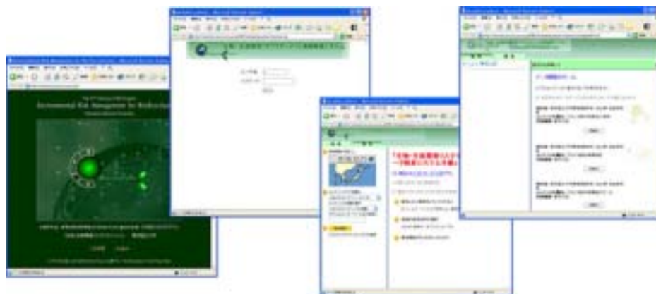
Figure2. MetadaService Using MetadaExplorer

2. GIS spatial data and social statistics data were collected, and Geodatabase-ization was built for the whole area of Japanese Kanagawa Prefecture in Japan and all the Chinese (For Soil, Industry and so on). Our Yokohama National University begins to introduce the space data, which a researcher made and which were analyzed to the public by using Metadataexplorer.