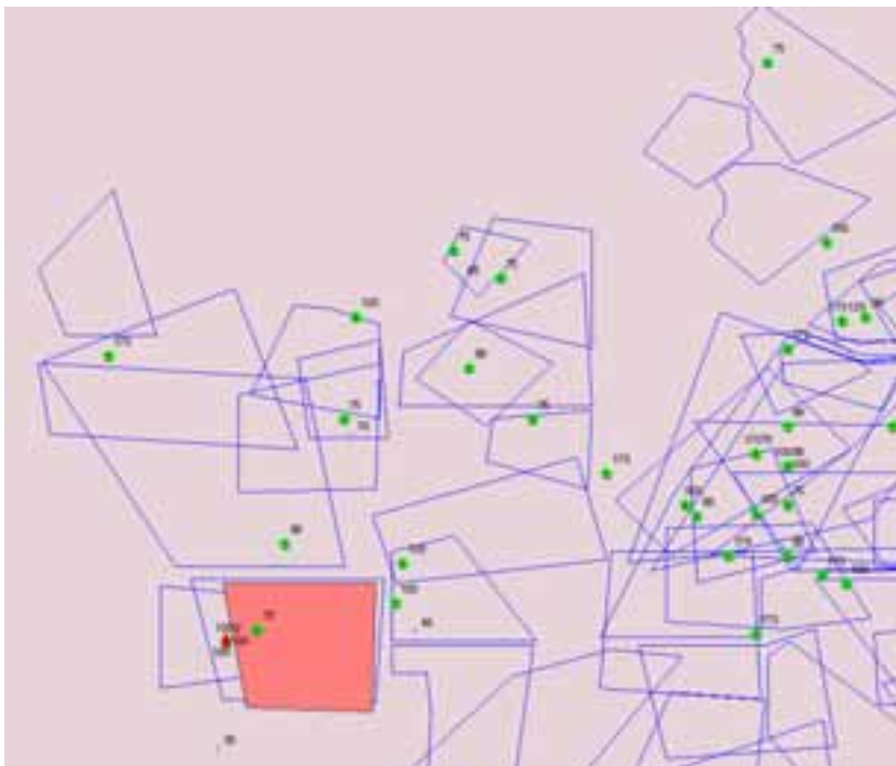
Figure 4. Hail reports (in green) overlaid with Severe Thunderstorm Warnings in New Mexico (blue unfilled polygons). The label for the hail reports is in hundredths of an inch, e.g., “75” signifies 0.75, or \frac{3}{4} ” hailstones. The single red filled polygon is for a tornado warning with the red diamond-shaped marker showing a tornado touchdown.