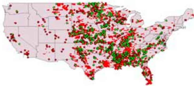
Figure 2. 2005 results, matching tornado warnings (red filled polygons) with tornado events (filled circles, green = event verified, red = event not verified).

Initial results have been very promising. ArcGIS has been used to compute the Probability of Detection (POD), or in other words, "was there a warning in place for the area that had a tornado touchdown". In addition, the Lead Time (LT) for each event that did indeed have a warning was computed. The resultant tables have been exported for statistical use in Microsoft Excel. Figure 2 below shows the 48-state view of polygon warnings and events. Figure 3 is a close-up look at the state of Mississippi, which seemed to be the most tornado-active region in the U.S. in 2005.