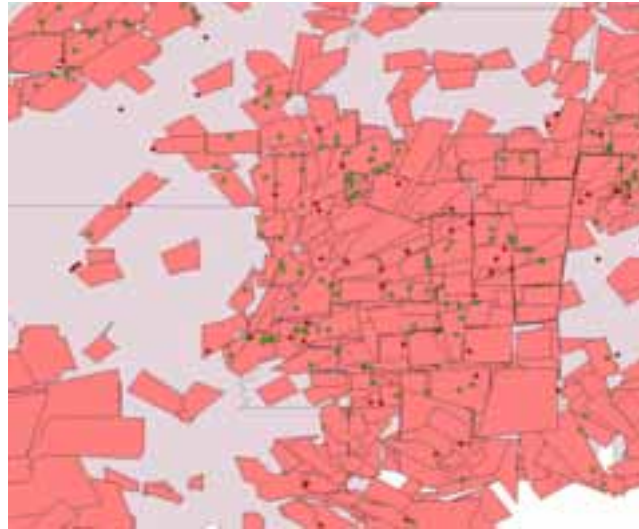
Figure 3. Close-in look over central Mississippi showing tornado warning polygons with overlays of events, both verified (green) and not verified (red).

methods. This is analogous to an archer shooting at a smaller target. It becomes more challenging to hit the target. This, however, is an indication of a higher quality of service, where a smaller population will be warned. This illustrates the importance of the agency developing completely new verification measures that better gauge the quality of warning support as the agency converts to polygon warnings.