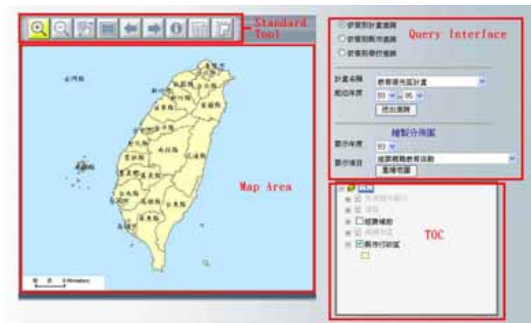
Figure 1. The Overview of the WebGIS Application

This application consists of the map area, table of content (TOC), developed query interface, and the standard tool, including zoom in, zoom out, pan, full extent, back, forward, identify, selection, and clear selection functions (Figure 1).