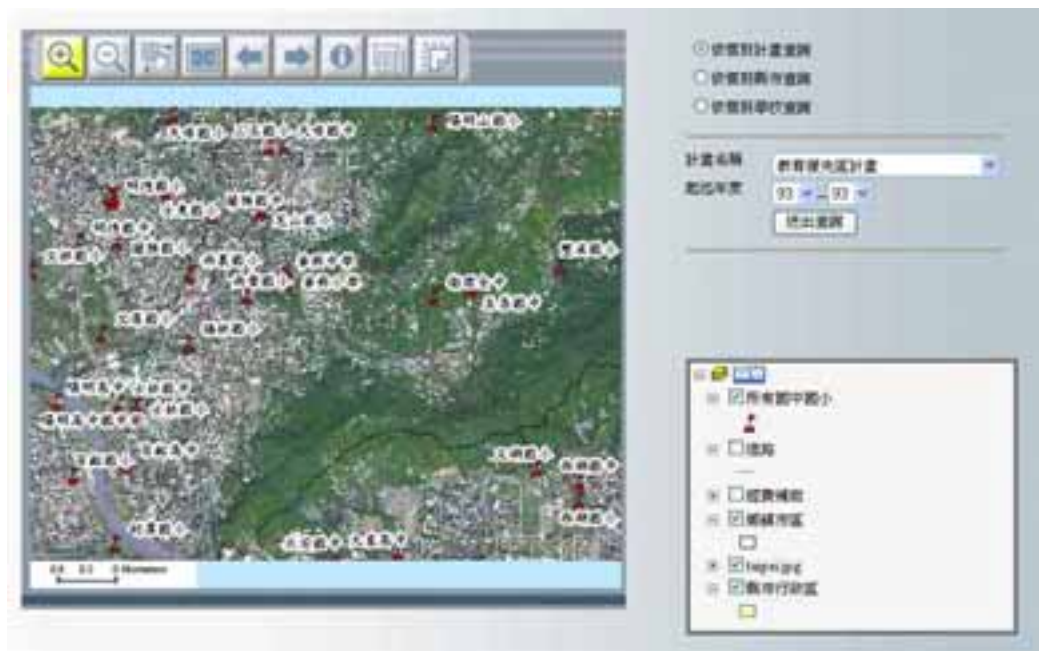
Figure 2. A Satellite Image, and the School and Boundary Maps in Taipei

To avoid the complexity of the map and to speed up the performance of the transactions, the visible scale of the satellite image is set to 1:50,000 (Figure 2). The satellite image will not be seen if the scale is smaller than 1:50,000. The satellite image, and schools and boundaries maps (Figure 2) display school locations and reveal the density of schools in each county.