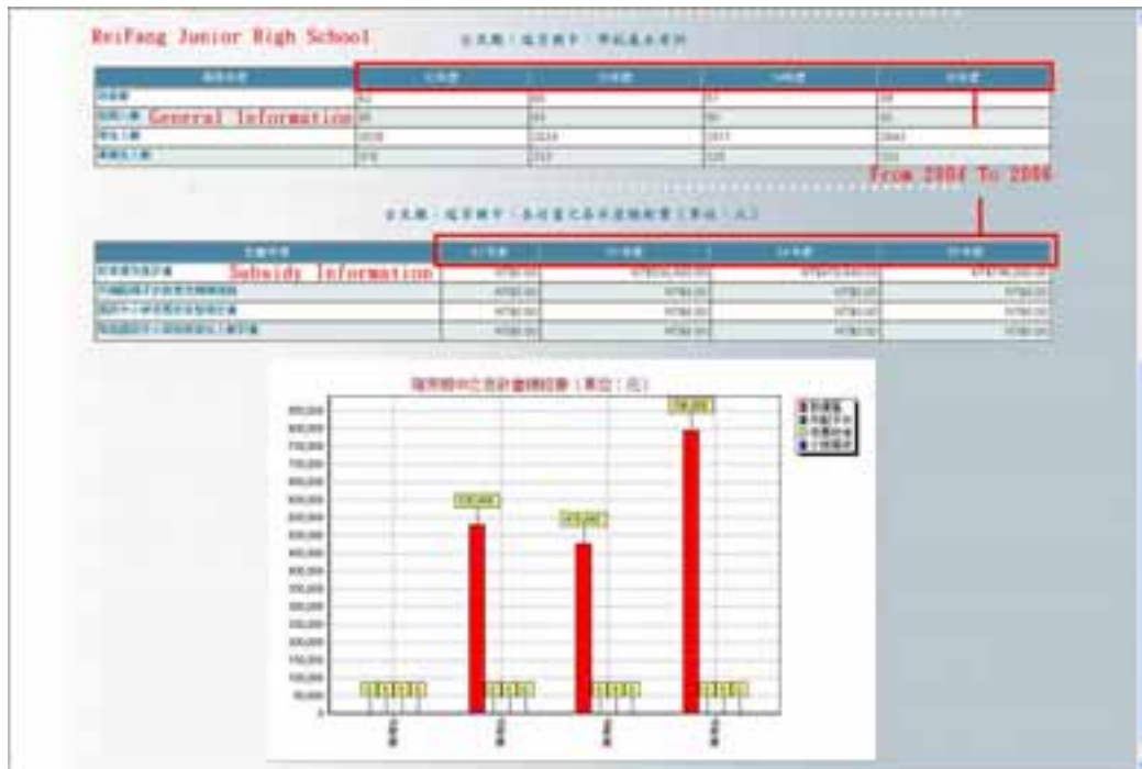
Figure 3. Result Chart and Tables

from 2003 to 2006, will be retrieved and shown in both tables and a chart (Figure 3). The information change during this period can be easily detected.