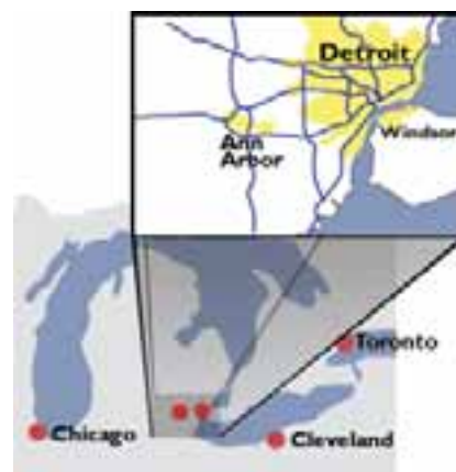
Figure 1: Ann Arbor Location Map 1

Ann Arbor, Michigan is located in South-East Michigan about 45 miles west of Detroit. Ann Arbor is home to University of Michigan. It is the state's seventh largest city with a population of 114,024 as of the 2000 census, of which 36,892 (32%) are college or graduate students. Ann Arbor's largest employers are in the fields of education, high tech and biotechnology fields. The city is known for its political liberalism and its large number of restaurants and performance venues.