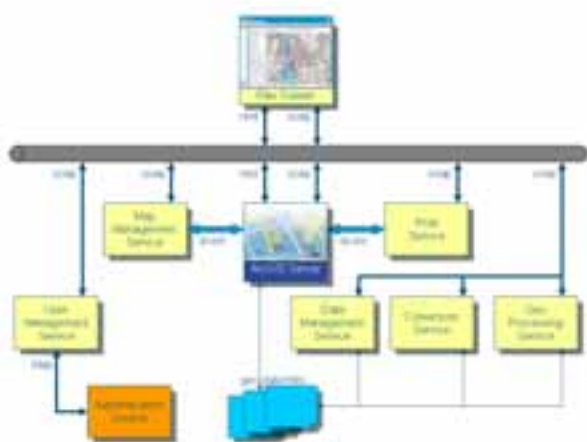
Figure 1 Architecture

This setup has several advantages. Because of the flexible and extendable nature of the system, it meets future needs and new functionality can be easily added as services. Moreover, these services can be developed independently in any language, and on any platform. The architecture also includes a security layer which implements WS-Security with respect to authorisation and authentication. In the future this layer will also support policy enforcement and policy decision points to regulate the access to individual resources in the infrastructure.