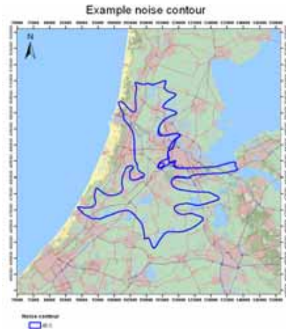
Figure 3 Example of a figure with a noise contour

A lot of interest has been received from clients that work in fields varying from defence to engineering in governmental and commercial sectors. Their main interest is the use of the architecture as a portal to their required GIS information and services.