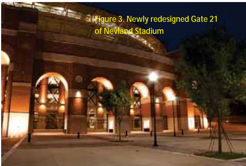
Figure 3. Newly redesigned Gate 21 of Neyland Stadium

In 2012, UTK partnered with a Landscape Architecture firm to propose a landscape