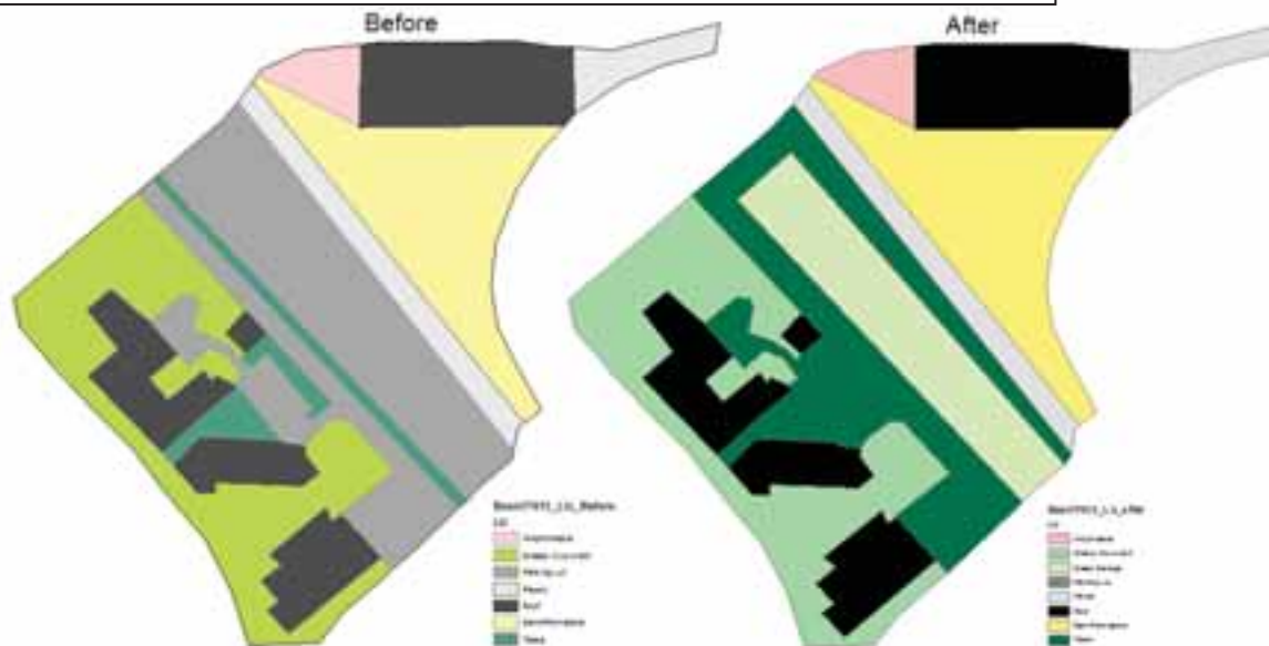
Figure 6. Landuse in the TN13 sub-watershed management area - before and after.

One of the tasks of the GIS student was to calculate the impact of the proposed design on the peak rate of runoff by creating a landuse feature class for Sub-Watershed Management Area TN13 – grassy courtyard, trees, parking lot, other paved, roof, semi-pervious paving, amphitheater (Figure 6). The Rational Method was used to estimate the peak rate of runoff as a function of the drainage area, runoff coefficient, and mean rainfall intensity for a duration equal to the time of concentration, t_c . The t_c is the time required for water to flow from the most remote point of the basin to the location being analyzed. The Rational Method is expressed as Q = CIA where Q = peak rate of runoff in \text{ft}^3 \text{s}^{-1} , C = runoff coefficient representing a ratio of runoff to rainfall, I = average rainfall intensity for a duration equal to the t_c (in/hr), and A = drainage area contributing to the design location (acres). The peak rate of runoff was calculated as 8.02 \text{ ft}^3 \text{ s}^{-1} before the green design was implemented and 5.45 \text{ ft}^3 \text{ s}^{-1} (a reduction of 32%) after the “green” garage was included and the rest of the parking area was replaced with trees. If the new green infrastructure could serve as detention/filter area for the roofs in this sub-watershed, the peak rate of runoff could be reduced to 3.88 \text{ ft}^3 \text{ s}^{-1} (a reduction of 52%).