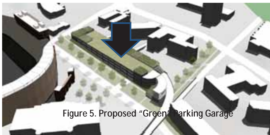
Figure 5. Proposed "Green" Parking Garage

systems that mitigate the impacts of urban stormwater while supporting sustainable communities (EPA, 2013). Our challenge was to build green infrastructure on campus not by construction of a single project, but rather through influence on campus planning. We started with design of a planned infrastructure project from the Campus Master Plan short-term priority list – ‘Parking Improvements on Lot S9’. Lot S9 is located in highly significant central location on campus, and is unfortunately the only available location for parking to support several major auditoriums and event facilities in the center of campus. Our intent was to demonstrate how a watershed-based approach to design; restoration of natural features, native associations, soils and ecosystem services; and creative 24/7/365 programming of activities could bring life and energy to an undesirable but required campus infrastructure project. Our ambition was to substantially influence the RFP issued for this ‘parking project’ so it would include greening and programming of the roof, walls, and surrounding site areas the site became more than a concrete rack to park vehicles for the buildings that surround it. As an increasing number of surface