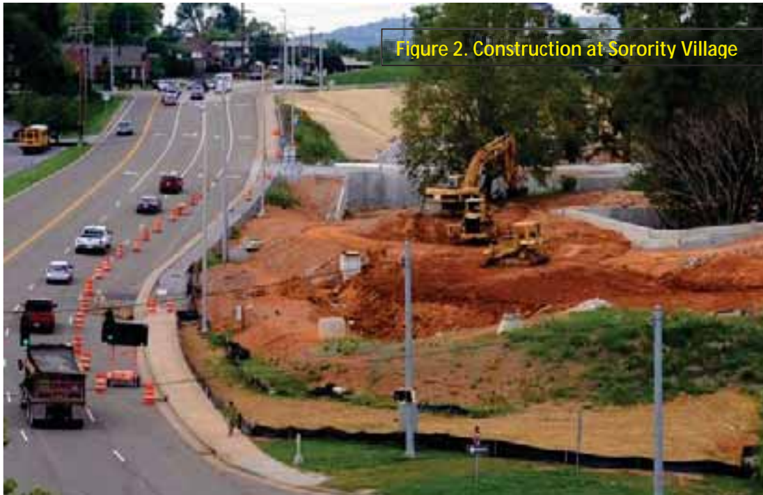
Figure 2. Construction at Sorority Village

penetration in water) in stormwater from the construction site of Sorority Village (Figure 2) - the highest ever recorded by this agency