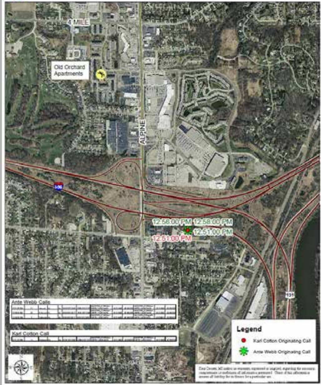
Exhibit 3 – Homicide at Old Orchard Apts @ 12:55pm