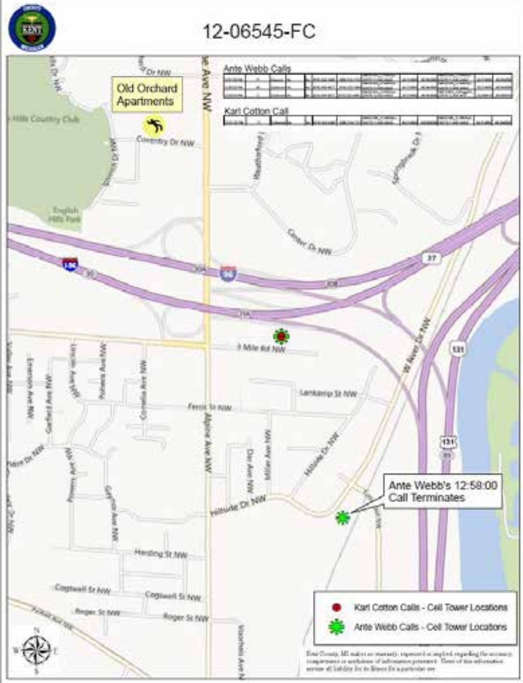
Exhibit 4 – 1 Suspect Fleeing @ 12:58pm