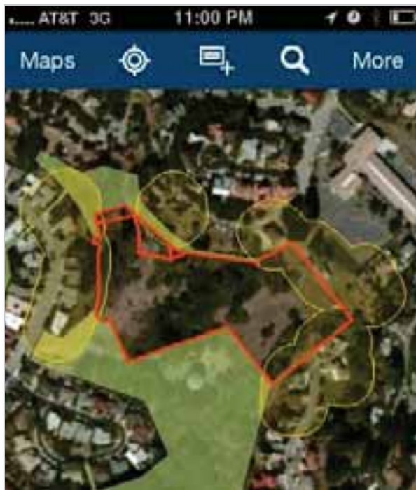
Offline web map viewing and editing in California

Live tracking on project sites during public walks with potential donors in Connecticut