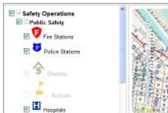
Table of Contents (TOC)/Legend Widget for JavaScript API